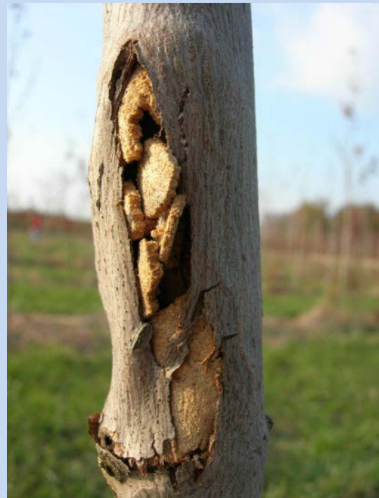
Image 4. The result of FHAB feeding are frass filled galleries or wounds left by the larva.

provide up to 3 years protection. Imidacloprid tablets (e.g., Discus ® Tablets) are generally slower and must be given at least one year in advance to prevent FHAB attacks. Other systemic products like dinotefuran (Safari®) have provided one year of protection in research tests. Remember to always read a current label because approved uses and rates can change.