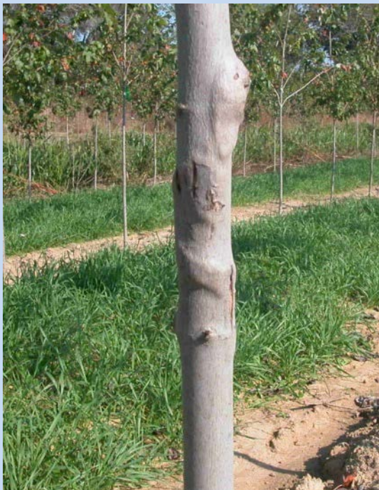
Image 3. Early damage signs from the FHAB larva include sunken and cracking bark.

into the roots and then translocate throughout the rest of the plant. These systemic insecticides can provide protection against the FHAB by killing the larva that attempt to feed on the tree. However, during the time period between the root drench and the uptake of the chemical by the plant, the tree is still susceptible to FHAB attacks. Due to this delay in control, it is important to apply these products as soon as the plants begin to leaf out during the spring to prevent FHAB attacks for the current year. Early to mid-April is often the ideal time to apply these systemic insecticides for controlling the FHAB for the upcoming growing season. Fall applications will also prevent FHAB attacks for the following season.