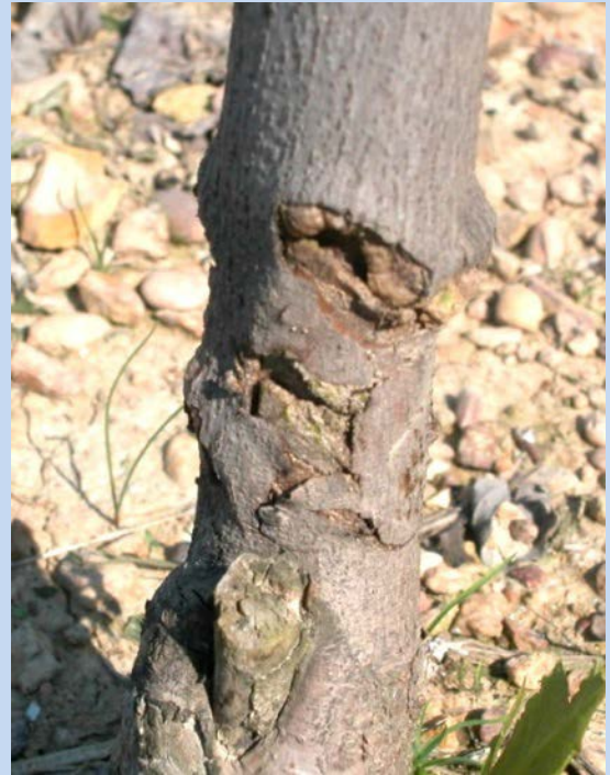
Image 5. Small trees are especially at risk from the FHAB since a single larva can complete girdle a tree as seen here.

Neonicotinoid insecticides, including imidacloprid, are potentially harmful to bees and have been the subject of recent concern. Be especially careful not to apply to plants in flower and follow the label's recommendations for minimizing bee exposure. Because of this high risk, at least one product (Mallet® 75WSP) specifically says do not apply to Tilia tree species.