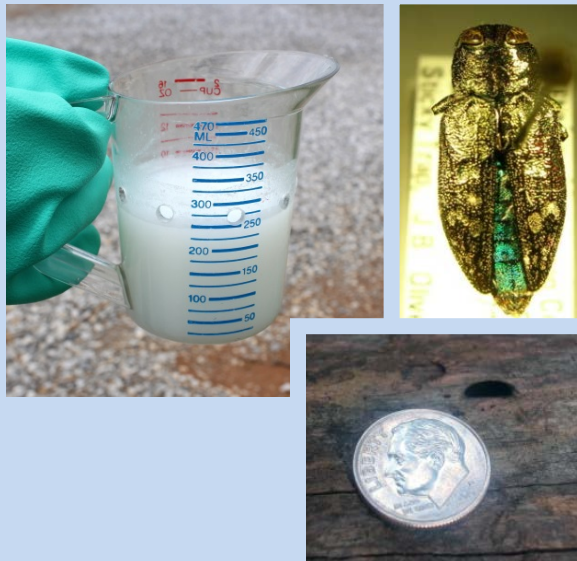
Image 6 (bottom right). A “D-shaped exit hole left by the adult beetle.