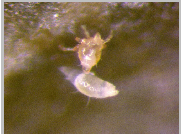
Image 5. An adult male broad mite is carrying a quiescent female. He may carry her to a new plant and begin a new generation.