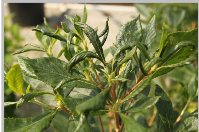
Image 3. Broad mite feeding damage on this Clethra sp. plant has resulted in small, stunted and cupped-shaped leaves that are slightly darker than the older unaffected leaves below.

Rotating chemical classes or modes of action is always wise, but this is especially important for broad mites because of their rapid lifecycle. Their ability to have multiple generations per year allows populations to quickly develop miticide resistance.