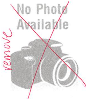
Byron Moore DPT Student, Physical Therapy