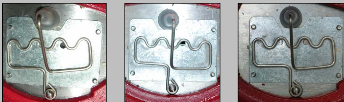
Fig. 3. Left Photo: Blocking plate with gap beneath fully opened. Center Photo: Blocking plate with gap beneath partially closed. Right Photo: Blocking plate with gap beneath fully closed.

Step 7: While moving the control handle (see Step 6), watch the hole in the blocking plate (Fig. 3). The hole must be completely open to properly dispense bait and completely closed to stop bait from exiting the hopper. A partially closed hole will not properly dispense bait and may result in blockage. It is best to become familiar with the handle direction needed to fully open and close the gap beneath the blocking plate while the spreader is empty of bait. In addition, it is a good idea to make sure the hole is fully opened or fully closed when the control handle is moved to the opened or closed position, respectively.