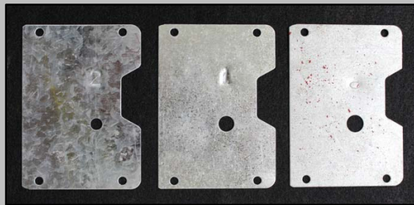
Fig. 1. Herd® spreader blocking plates: #2 ( left image ), #1 ( center image ), and #0 ( right image ). The center hole is where bait drops from the spreader. The four outer holes are used to position the blocking plate on the spreader. The #2 has the smallest diameter hole at 0.28 in (7 mm), followed by the #1 at 0.35 in (9 mm) and the #0 at 0.39 in (10 mm).

Three blocking plate sizes are recommended by the Herd® manufacturer for fire ant baits currently approved for usage in the Federal Imported Fire Ant Quarantine (FIFAQ), including #0, #1, and #2 (Fig. 1).