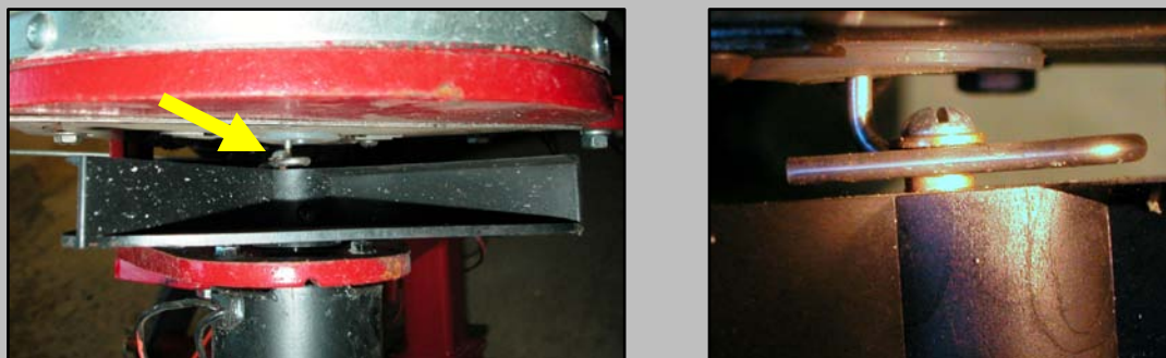
Fig. 2. Left Photo: Area between Herd® spreader hopper and four-bladed fan where stainless steel agitator wire connects to the screw above the fan blades. Right Photo: Close-up image of agitator wire properly positioned with the screw in the middle of the wire hook.

Step 5: Look underneath the outside of the spreader between the four-bladed fan and the underside of the metal hopper (Fig. 2). You should see a small flathead screw above the fan with a stainless steel wire on both sides of the screw (Fig. 2). The stainless steel wire is the lower part of the agitator wire shown in Step 3. If the wire is not centered over the screw on top of the fan blade, the agitator wire will not move when the fan is turning and bait will not be dispensed. From our experience, the lower part of the agitator wire may become disconnected when performing Step 3 above. If the lower agitator wire is properly positioned, then finish tightening the bushing screw in Step 4. If it is not, you will have to maneuver the agitator wire inside the hopper (see Step 3) until it is properly centered on the screw above the fan blade before tightening the bushing screw in Step 4.