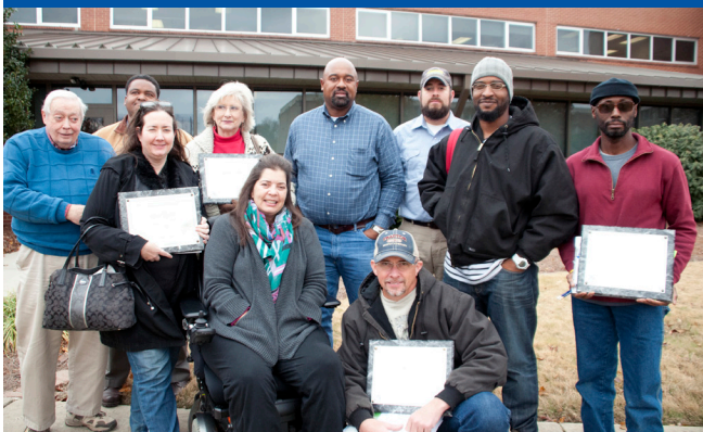
2014 graduating class

The program focuses on teaching the concepts, providing the information, and facilitating the hands-on experience needed to build solid, viable, and successful agricultural businesses.