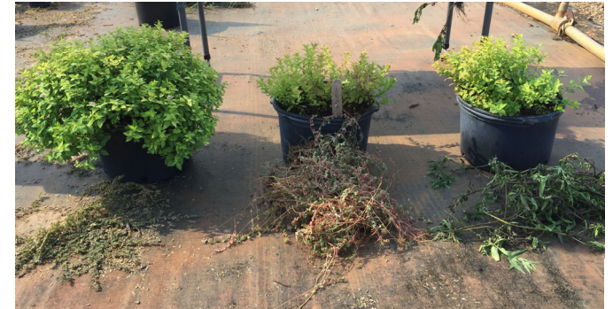
Figure 2. More frequent hand weeding (plant at far left) increases crop growth and reduces labor compared to less frequent hand weeding (two plants on right).

Growers should periodically scout for weeds in nursery containers and production areas to properly identify weed species and to select the most effective control method. Research has shown that more frequent hand weeding in nursery containers can save labor costs over time as small weeds are easier to pull compared to removing overgrown weeds. Hand weeding conducted at routine intervals (every 2-3 weeks) also reduces weed seed banks by removing weeds prior to flowering and seed formation.