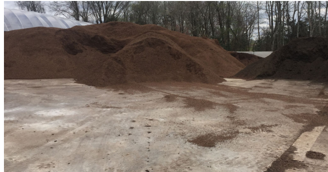
Figure 1. Properly stored pine bark substrate on a concrete pad with side walls.