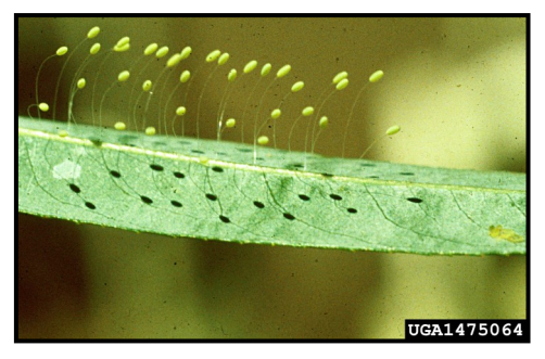
Figure 2:. Green lacewing eggs.

Adult females lay their eggs as small batches on plant materials. They prefer to lay eggs among aphid colonies. Lacewing larvae are cannibalistic and attack sibling eggs and larvae. To avoid the first hatched larva/larvae attacking unhatched eggs or young larvae, females lay each egg on a long stalk. Eggs are oval in shape and approximately 0.02 inches long. Newly laid eggs are green in color and turn brown when they are matured and ready to hatch. Once eggs are hatched, egg sacs become white and remain attached to their stalks. If you see white lacewing eggs, they are probably hatched eggs.