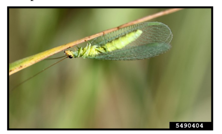
Figure 1:. Green lacewing adult. Photo credit: Whitney Cranshaw, Colorado State University, Bugwood.org (UGA5490404).

Natural enemies such green lacewings as (Neuroptera: Chrysopidae) are important for sustainable agriculture because they provide us a free service in managing and controlling unwanted insect and mite (arthropod) pests in agricultural crops in fields and greenhouses. Green lacewings are predators of many soft-bodied insects (e.g. aphids, thrips, mealybugs, soft scales, whiteflies, psyllids and small caterpillars) and mites (e.g. spider mites) and their eggs. They are called generalist predators because they feed on many different types of insect and/or mite prey. Green lacewings are considered as one of the most important predatory natural enemies of agricultural pests.