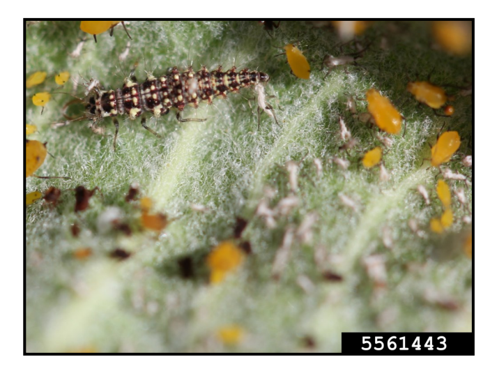
Figure 3:. Green lacewing larva feeding on aphids

Lacewing larvae look like tiny alligators. They are voracious predators of soft-bodied insects. Each larva has a pair of large sickle-shaped mandibles. Larva uses the mandibles to pierce the body of its prey and suck the body fluids. They are very active individuals and fast runners. The larvae can move more than 100 feet when searching for prey. There are three larval stages in lacewing lifecycle. At end of first or second larval stage, each larva sheds the old skin and become the second or third larva, respectively. At the latter part of its development, the third stage larva weaves a round silken cocoon to pupate.