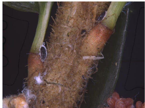
Figure 2. HWA crawlers emerging from wool (top). Second instar HWA nymph feeding at base of needle (bottom).

white, woolly egg sacs and crawlers on branch tips (Fig. 3). Branches with graying foliage may indicate an infestation and if present, HWA crawlers will be feeding at needle cushions at the base of needles in early spring. Management of HWA in Nurseries. In nursery production, treatment