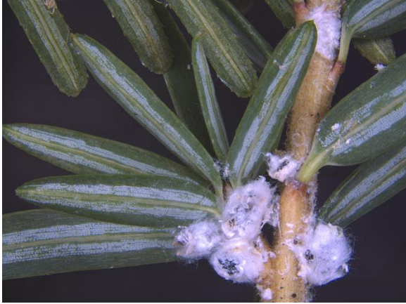
Figure 3. Adult HWA with woolly egg sacs.

options include either foliar sprays or systemic drenches of insecticides. The best time for foliar treatments is early spring when first generation crawlers are most vulnerable. Systemic insecticide drench applications are another option for season-long control.