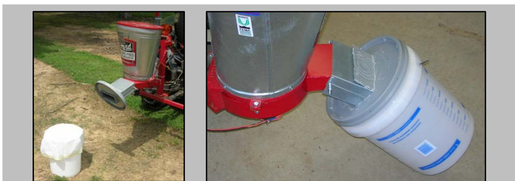
Fig. 6. Left photo: Five gallon bucket lined with trash bag on the ground in front of a Herd® GT-77 spreader with a slotted bucket lid slid over the end of the chute attachment. Right photo: Close-up of bucket lid slid onto chute attachment.