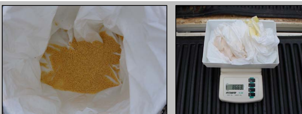
Fig. 9. Left photo: Bait collected in trash bag. Right photo: Trash bag with bait weighed inside a plastic pan on a scale.

Note: It is not necessary to empty the bait collection bag if you need to capture more bait for additional calibration, because you can subtract the difference of each successive bait collection from the weight of the previous collection to determine how much bait you are capturing at each collection event.