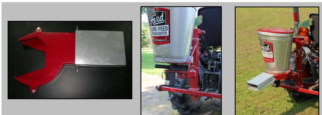
Fig. 5. Left photo: Chute attachment for a Herd® GT-77 spreader. Middle photo: Herd spreader without chute attachment. Right photo: Herd spreader with mounted chute attachment.

Step 5: Bait must be collected from the spreader to determine output rate. Some spreaders like the Herd® GT-77 have a chute attachment that facilitates collecting bait for calibration (Fig. 5). A five-gallon bucket lid with a slot cut large enough to fit over the chute opening is an excellent way to collect bait (Fig. 6). A plastic bag can be placed inside the bucket to catch the bait to facilitate the subsequent weighing. Other spreaders like the Vicon can have a plastic bag zip-tied to the dispensing spout to collect the bait (Fig. 7)