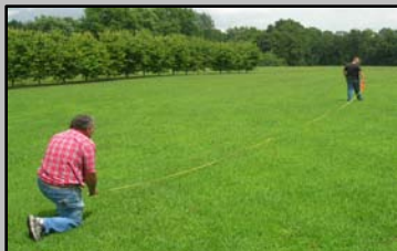
Fig. 1. Marking a driving course with a measuring tape.

Step 1: Measure a 100 foot long driving course (Fig. 1).