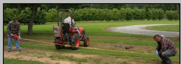
Fig. 4. Measure the bait spreader swath width.

Step 4. Run the spreader for a few seconds and measure the width of the bait swath distributed by the spreader (Fig. 4). The edge of a cultivated field or a nursery row are good locations to calibrate because the bare soil allows you to see the bait particles.