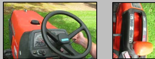
Fig. 3. Left photo: Moving the throttle lever on a tractor by hand to increase or decrease engine speed (RPM) on the tachometer. Right photo: Multiple gear and high/low options are typical of most tractors.

Step 3 (Optional but suggested): It will be helpful to measure travel times for multiple gear and engine speed settings to facilitate later calibration steps.