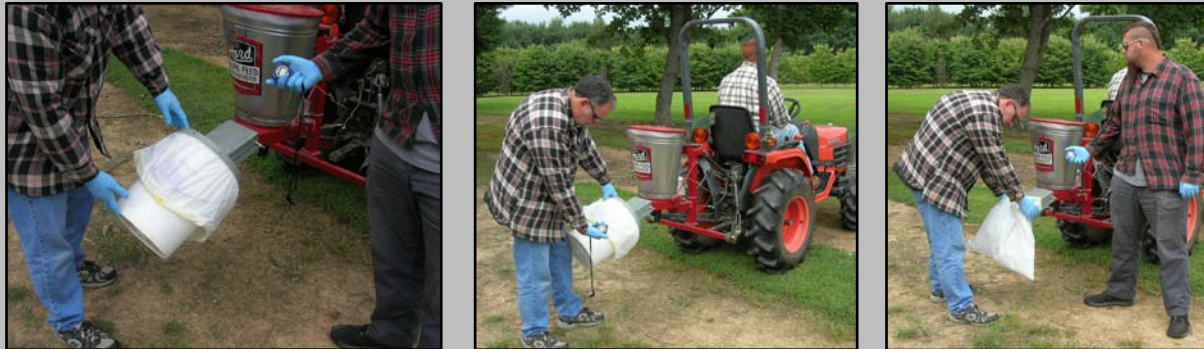
Fig. 8. Left photo: Capturing bait from a Herd® GT-77 spreader using a bucket with a slotted lid with an assistant timing the collection. Middle photo: The bucket collecting method also allows a single person to both collect and time the collection using their leg to keep the bucket in place. Right photo: Holding a collection bag directly on the chute attachment without a bucket. Note that two hands are required to hold the bag in place and that a second person is needed to time with this method.

Step 5 (continued): Collect bait from the spreader for the same amount of time it took to drive the 100 feet driving course (see Step 2) (Fig. 8).