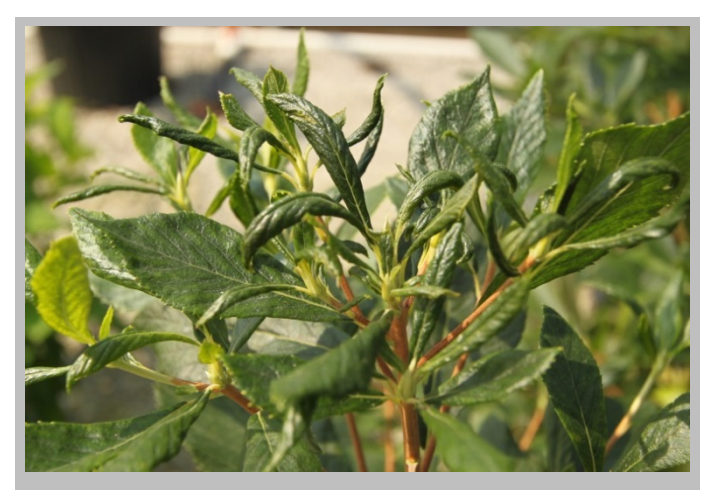
Image 3. Broad mite feeding damage on this Clethra sp. plant has resulted in small, stunted and cupped-shaped leaves that are slightly darker than the older unaffected leaves below.

Rotating chemical classes or modes of action is always wise, but this is especially important for broad mites because of their rapid lifecycle. Their ability to have multiple generations per year allows populations to quickly develop miticide resistance.