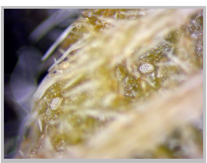
Image 2. Eggs are one of the easiest distinguishing features to look for when identify broad mites. Under a microscope the eggs appear as clear round little spheres covered with white opaque dots.

Broad mites have a short and rapid lifecycle living between 5 and 13 days. An unmated female will lay male eggs only, but after mating, she will lay about 4 female eggs for every male egg. Eggs are clear, elliptical, and covered with opaque white dots (Image 2). In a few days, 6-legged larvae will hatch and immediately begin to feed. Two to 3 days after hatching, the larvae enter an inactive ( i.e. , quiescent) phase. Active adult males will pick up and carry the quiescent females (Image 5) until they become active, at which time, mating occurs.