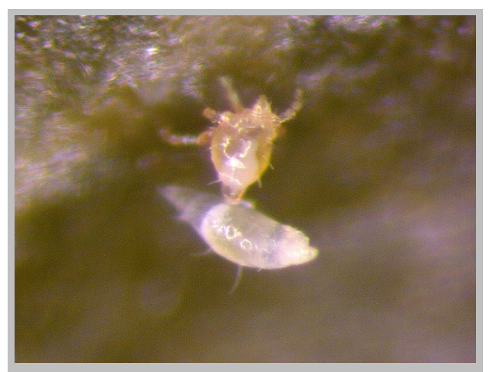
Image 5. An adult male broad mite is carrying a quiescent female. He may carry her to a new plant and begin a new generation.