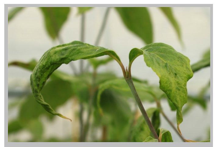
Image 1. The leaves on this dogwood ( Cornus florida ) plant are stunted, strap-like and curling downward in response to broad mite feeding.

Broad mites ( Polyphagotarsonemus latus ) are a species of small mites that damage many ornamental crops. They are most active during the warmer summer months but they may be active year round in a greenhouse. If not controlled in time, feeding damage can result in unmarketable plants. Broad mites typically feed on the newest growth, which eventually becomes deformed and stunted. Broad mites are almost impossible to see with the naked eye and are best viewed with a strong hand lens or microscope.