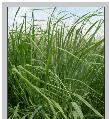
Fig. 3. Switchgrass is an example of the types of grasses that can be used to produce cellulosic ethanol.

Currently, there are two basic types of biofuels; ethanol and biodiesel. Ethanol has traditionally been produced from corn (corn ethanol) but it can also be produced from other plant material like grasses (cellulosic ethanol) (Fig. 3).