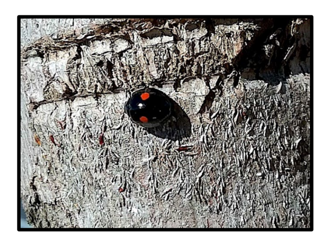
Fig. 3. Chilocorus stigma – twice-stabbed lady beetle adult

back densely covered with tiny hairs (Kabashima, 2023). The twice-stabbed lady beetle, Chilocorus stigma (Fig 3), is a larger, shiny black beetle with two red spots on its back. Previous studies conducted by Addesso et al. (2016) observed twicestabbed lady beetles feeding on JMS in Tennessee nurseries.