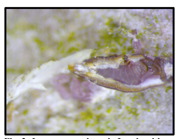
Fig. 2. Japanese maple scale female with eggs under wax covering.

covering repels water and so the scale is protected from insecticide formulations applied in water unless the wax cover is disrupted (Fig. 2). With two generations per year, the reproductive potential of this pest is high. A single male and female scale have the potential to reproduce millions of new scales in a few years' time. Under natural conditions, predators, parasitoids, and diseases prevent scale numbers from reaching outbreak levels. However, broadspectrum pesticide use in nursery systems significantly reduces the population of natural enemies, leading to scale outbreaks.