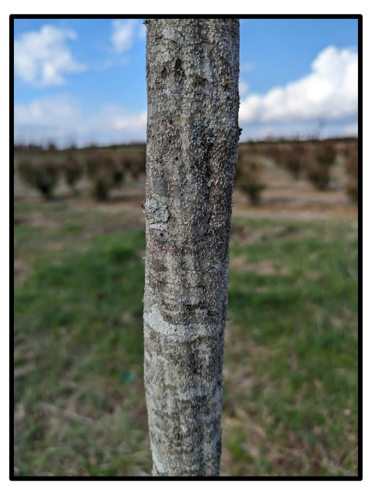
Fig. 1. Japanese maple scale infestation on hornbeam.

woody ornamental production areas (Fulcher et al. 2012, Addesso et al. 2014). There were 26 recorded shipment rejections of nursery trees originating in Tennessee from 2021-2023 due to the presence of JMS, posing an economic threat to growers (pers. comm, Tennessee Plant Certification Administrator). The small size of the insect (1-2 mm), its waxy covering, and its barklike coloration make it challenging to identify and manage (Fig. 1). The wax