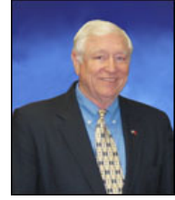
Dr. Harry A. Green Pi Alpha Alpha Honorary Award