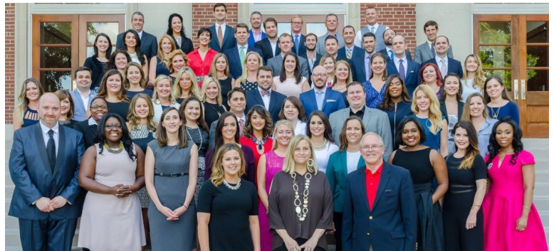
2016 Emerging Leaders Award Recipients