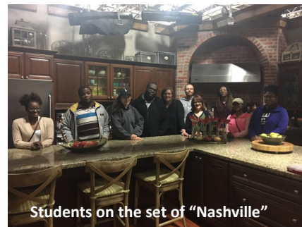
Students on the set of "Nashville"