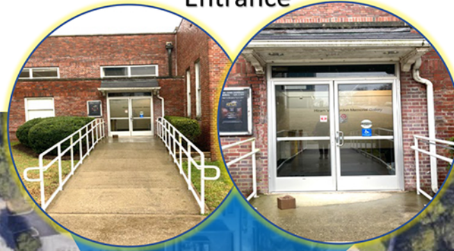
Elliott Hall Entrance