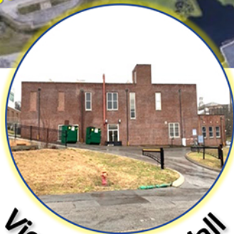
View of Elliott Hall from Parking Lot L