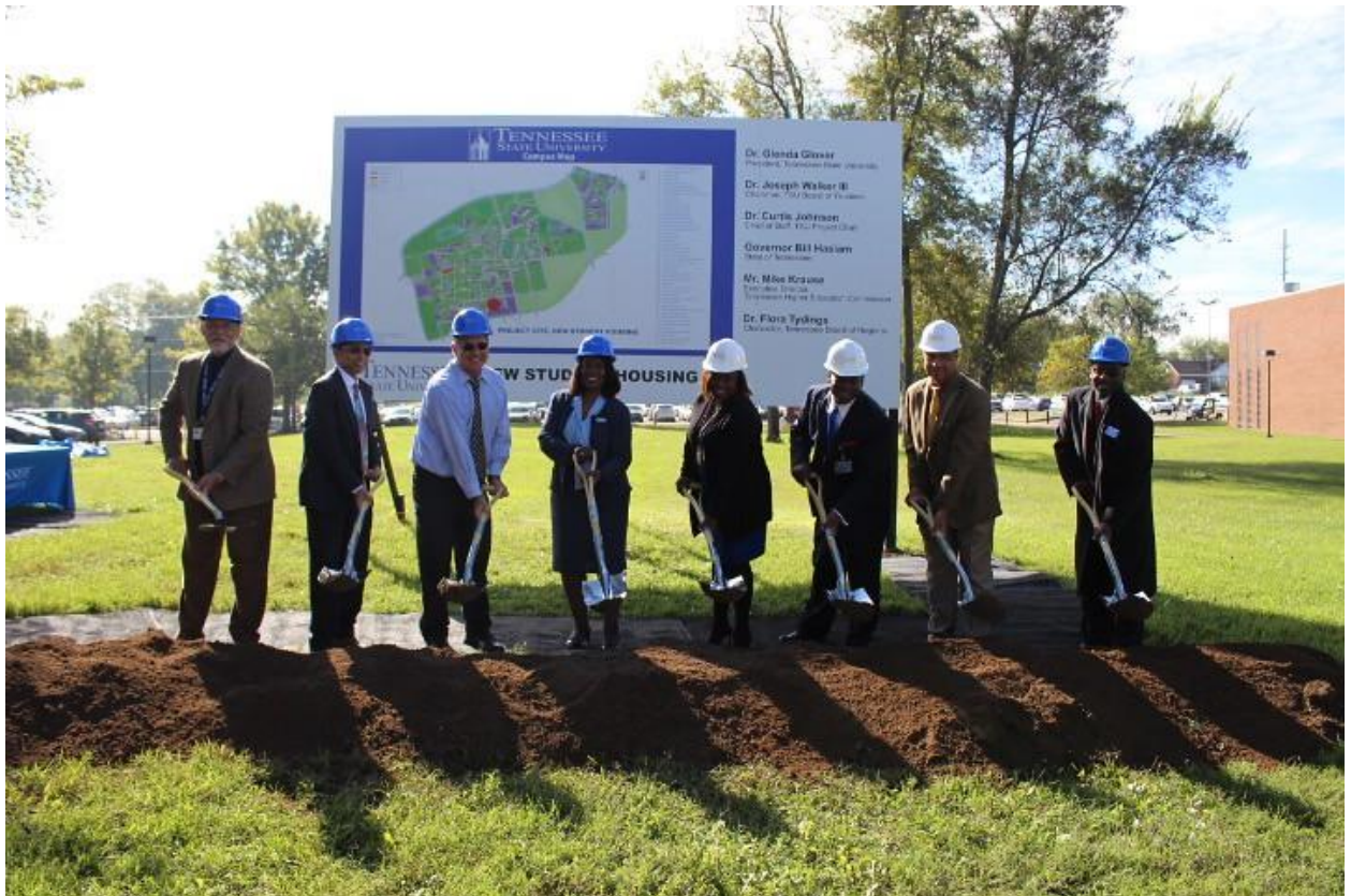
Groundbreaking for new residence halls

Fiscal 2018-2019 began with the campus showing signs of progress with the groundbreaking ceremonies for three new buildings. University administrators, State legislators, students, faculty and construction executives were on hand during the announcement of these new ventures. The new building projects included two new residence halls at an estimated cost of $75.3 million, and a Health Sciences Building projected to cost $38.8 million. Additionally, alums Amos and Brenda Otis made a commitment of one million dollars to fund the construction of the Alumni Welcome Center near the entrance of the campus. All construction projects are expected to be completed by 2020.