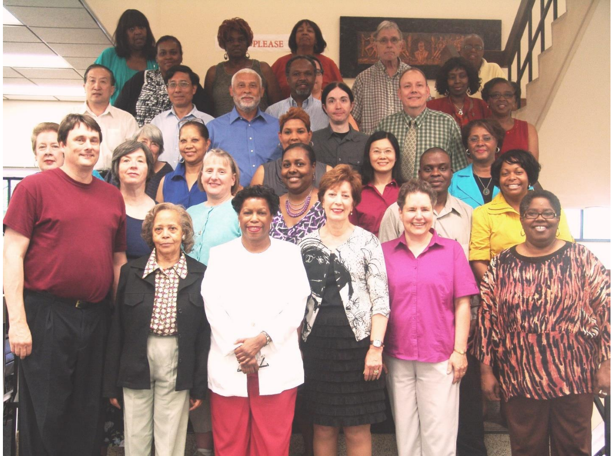
Library staff circa 2013