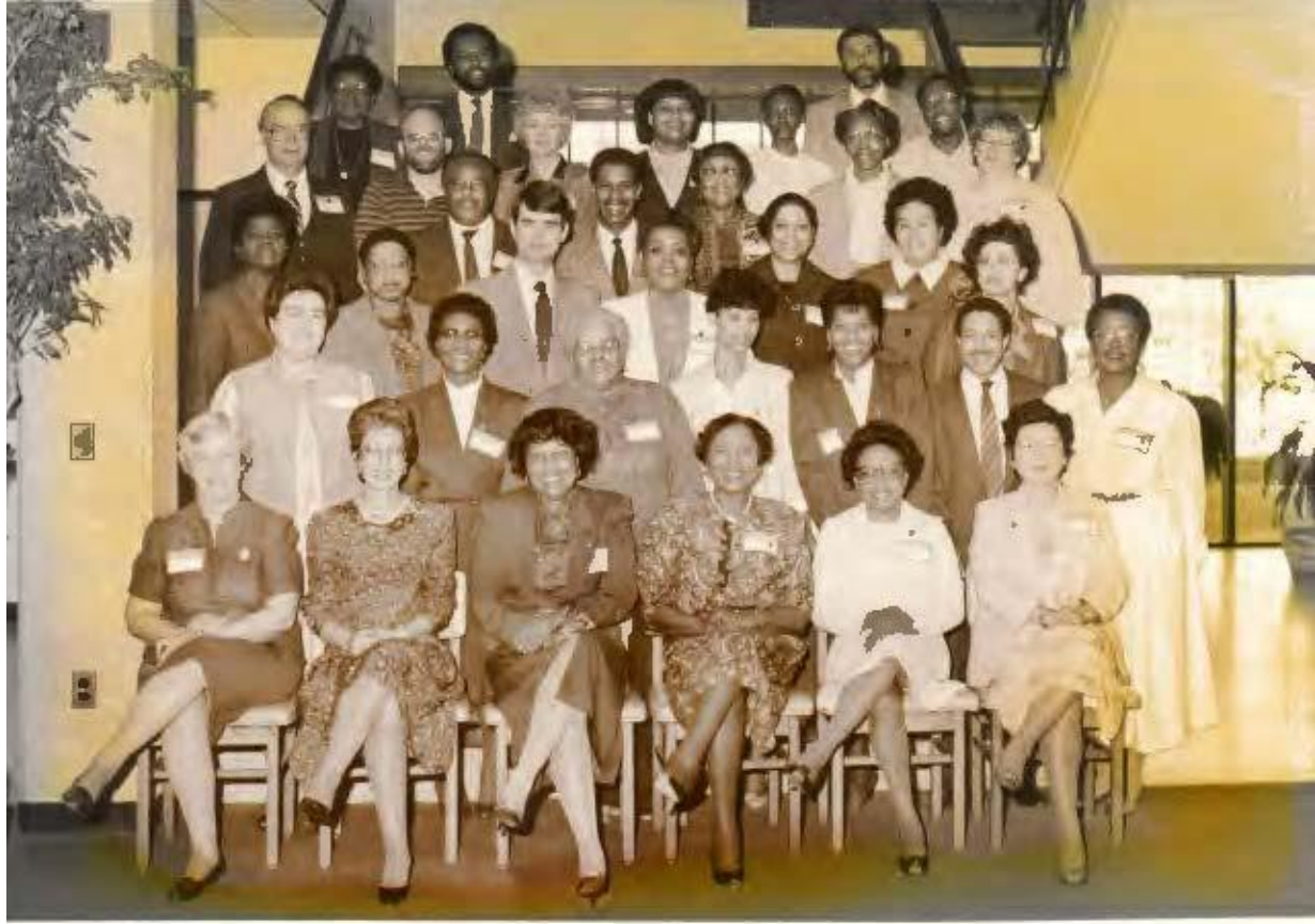
Staff photo (circa 1983)