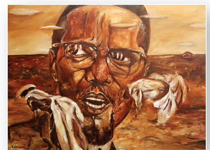
Voice of the Masses