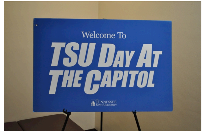
Big Blue was represented throughout the Tennessee Capitol.