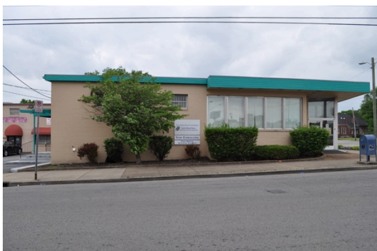
The 15th Avenue Baptist Child Learning Center