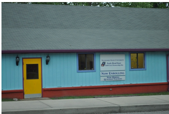
Mini Rock Stars in Nashville has officially joined the Early Head Start – Child Care Partnership Program.