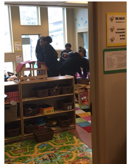
The student volunteers helped organize materials in the classroom.