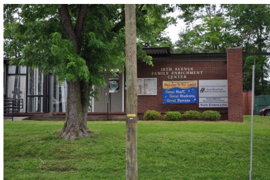
The 18th Avenue Family Enrichment Center