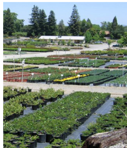
Containerized nursery plants grown outside the greenhouse environment have the potential for IFA infestation.

Certificates authorizing movement of regulated articles are issued by quarantine officials when certain approved procedures have been utilized to ensure that the regulated article(s) are free from IFA infestation. See page 18 for a complete listing of State plant regulatory officials and USDA State Plant Health Directors.