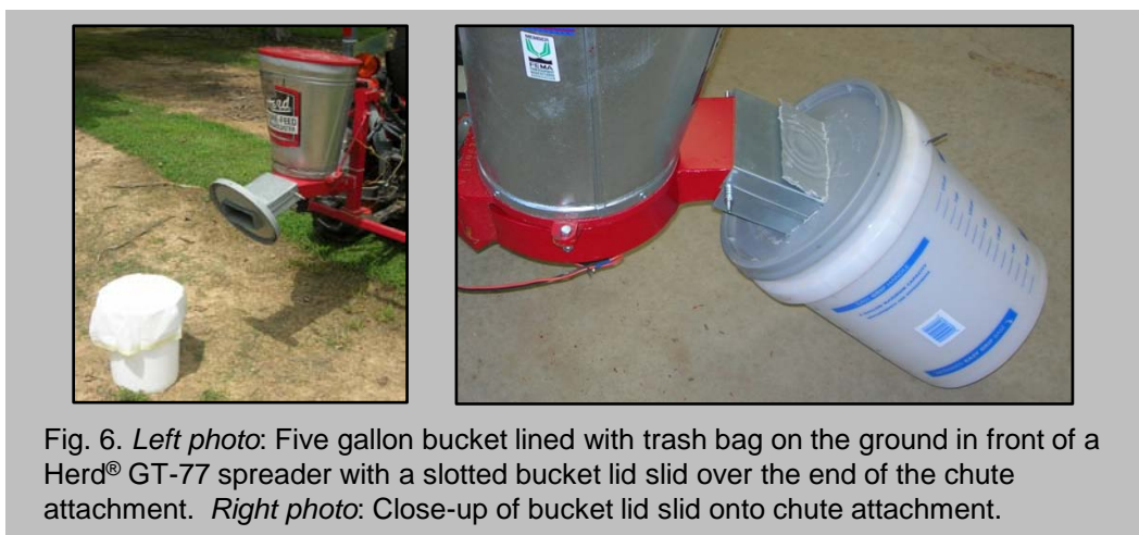
Fig. 6. Left photo: Five gallon bucket lined with trash bag on the ground in front of a Herd® GT-77 spreader with a slotted bucket lid slid over the end of the chute attachment. Right photo: Close-up of bucket lid slid onto chute attachment.