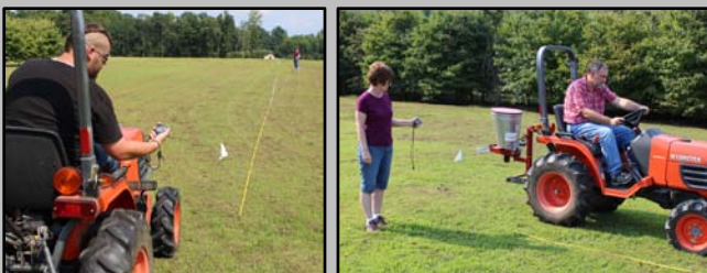
Fig. 2. Travel time can be timed by the vehicle operator ( left photo ) or with the help of another person ( right photo ).

Step 2: Select a gear and engine speed (RPM) setting that you could use in the nursery and time the application vehicle on the 100 foot course (Fig. 2). It is best to drive the course in one direction and then back. Then average the two travel times.