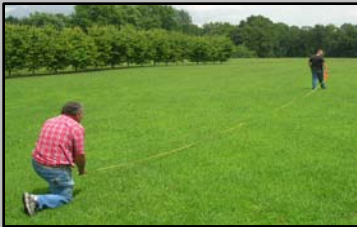
Fig. 1. Marking a driving course with a measuring tape.

Step 1: Measure a 100 foot long driving course (Fig. 1).