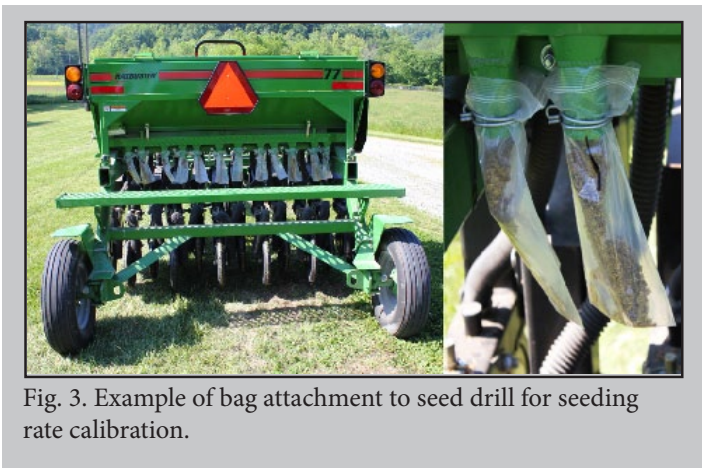
Fig. 3. Example of bag attachment to seed drill for seeding rate calibration.

Step 2: Remove hoses from beneath native grass box and attach pre-weighed bags under seed cups using the hose clamps (Fig. 3).