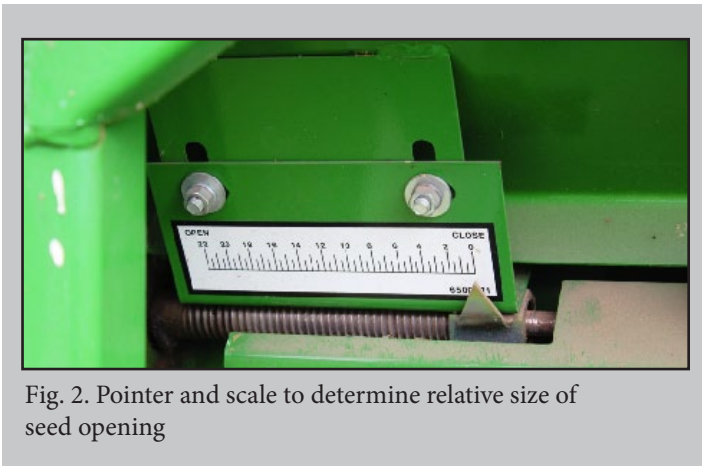
Fig. 2. Pointer and scale to determine relative size of seed opening