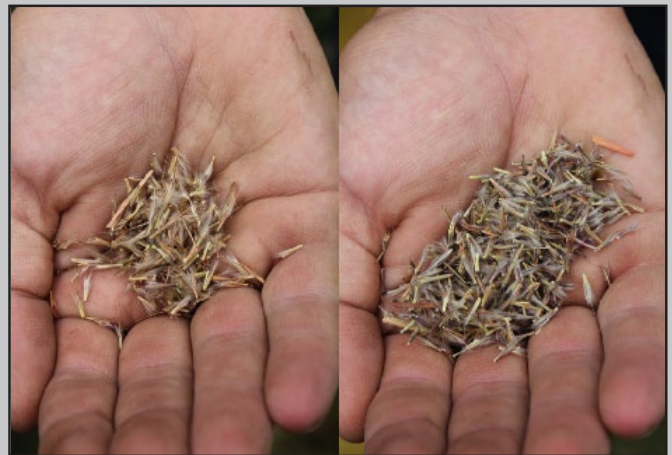
Fig. 4. Little Bluestem 'Aldous' seed from different seed companies. The seed on the left may have greater fluffiness which could make it more difficult to flow through the seed drill at a regular rate.

Not all seed is the same. Even seed that is of the same species and variety may be different depending on the way they were cleaned. This will differ based on the seed supplier you order seed from. Figure 4 shows two types of seed that are the same species and variety (Little Bluestem 'Aldous') but from different suppliers.