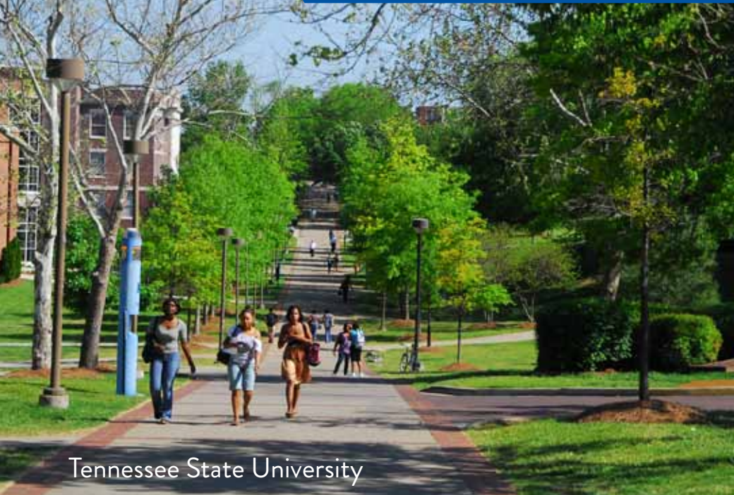
Tennessee State University