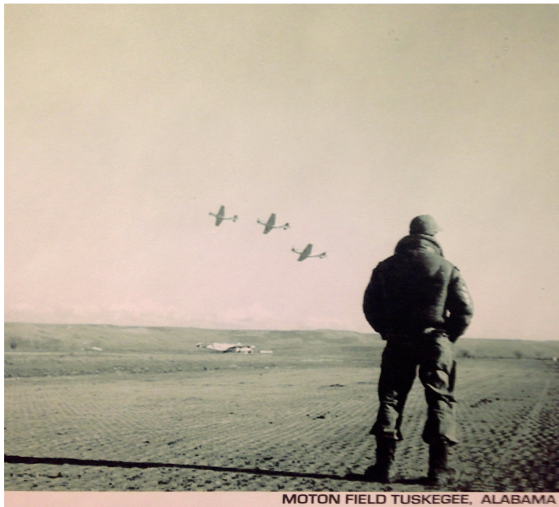
MOTON FIELD TUSKEGEE, ALABAMA